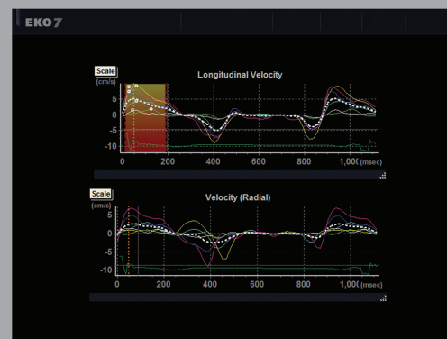
Results - Different presentations of Strain

Speckle Strain enables simultaneous evaluation of radial, longitudinal, and circumferential myocardial deformation. Speckle Strain is useful for early detection with unrivaled accuracy. Speckle Strain supports many key diagnostic tools; in particular, the ability to display old and new data in chronological order enables easy and instant comparison of vital data.