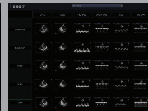
Protocol - Expandability