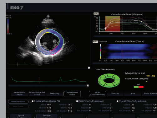
Results - Different presentations of Strain